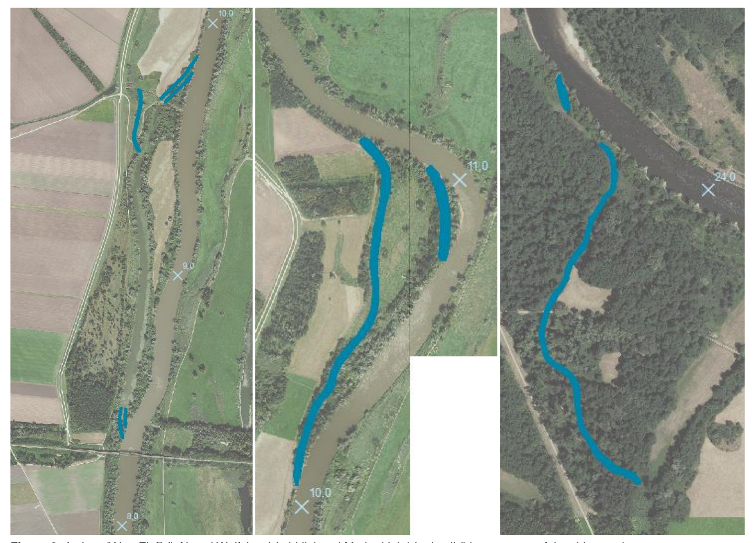
Figure 2: Actions "Alter Zipf" (left) and Wolfsinsel (middle) and Maritz (right) in detail (blue: courses of the side arms).